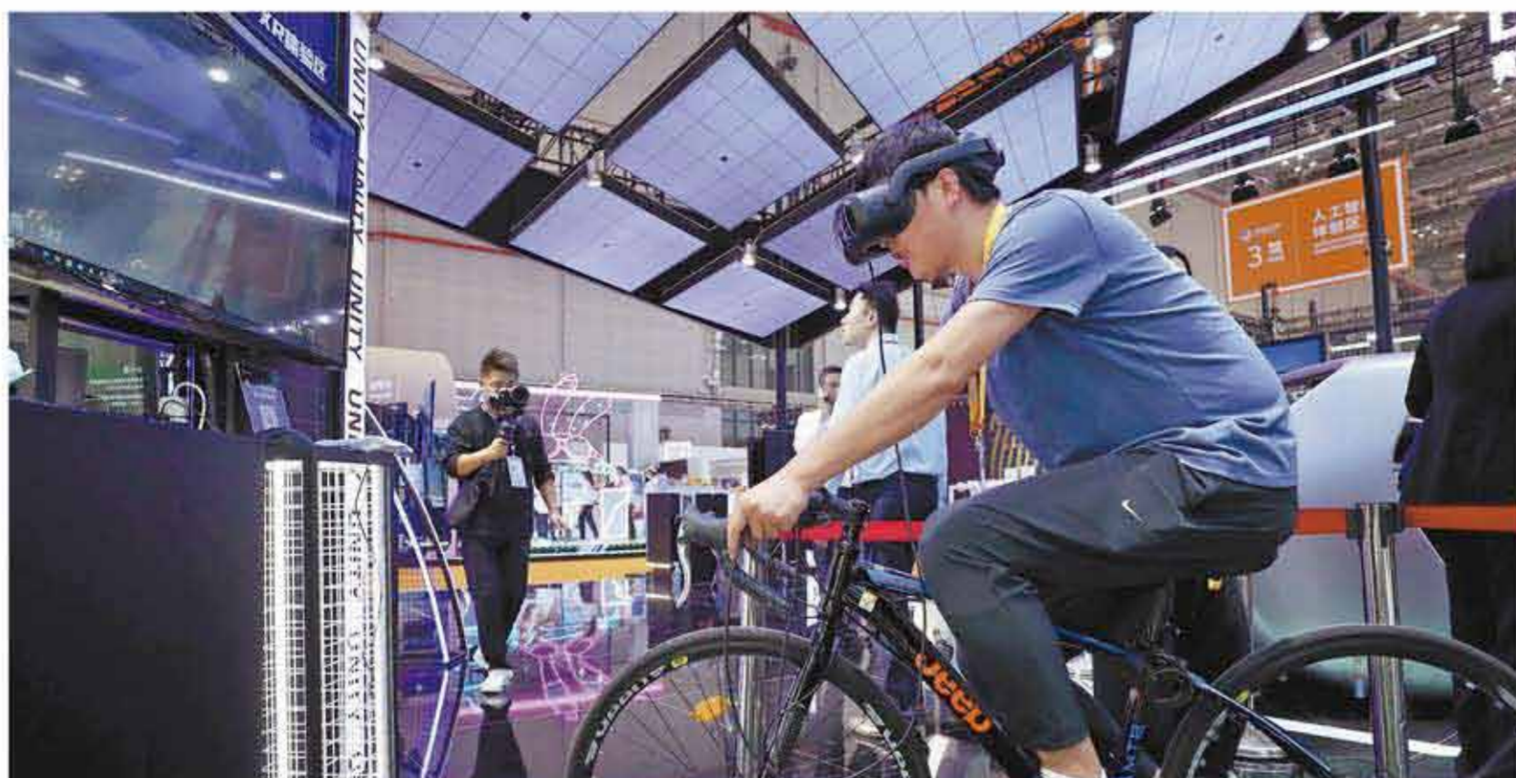
An exhibitor's representative tries a bicycle featuring virtual reality technology at the sixth China International Import Expo in Shanghai on Nov 5.