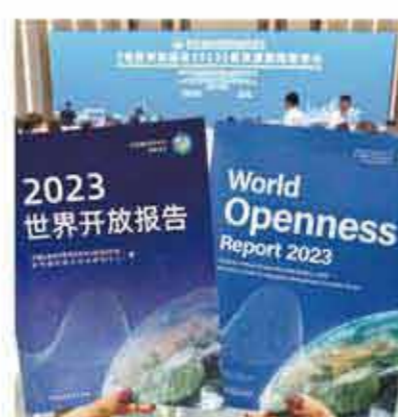
Chinese and English versions of the World Openness Report 2023 on display at a news conference in Shanghai.

From 2008 to 2022 the openness index for advanced economies fell from 0.8543 to 0.7882, and for emerging economies and developing countries the corresponding figure